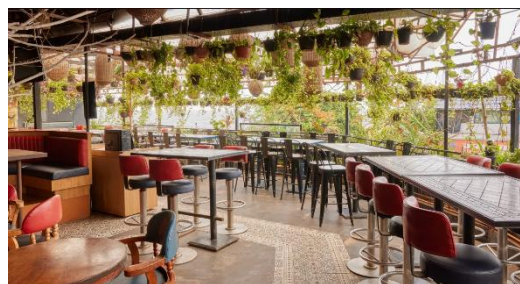
Fig.6.1.2: Interior view