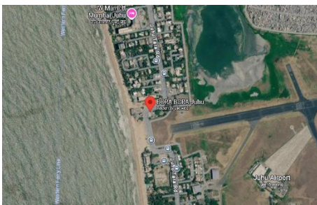
Fig. 6.1.1: Location map Bora Bora restaurant