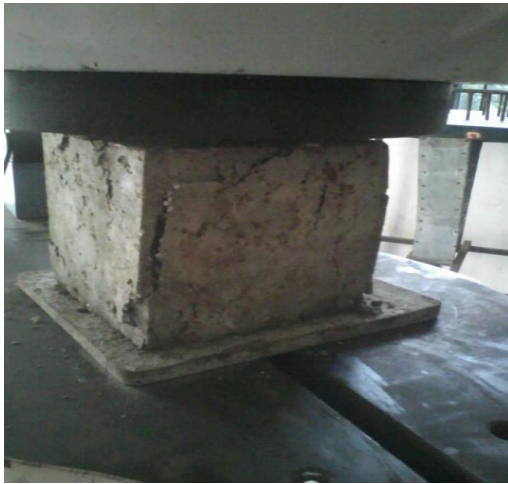
Fig.2 – Compression test

Concrete cubes (150x150x150mm) of M25 grade concrete have been casted, the conventional cubes and the cubes with replacement of cement by 10%, 20%, 30% Silica fume and 5% of coarse aggregate by expanded polystyrene have been tested. The results have been given below,