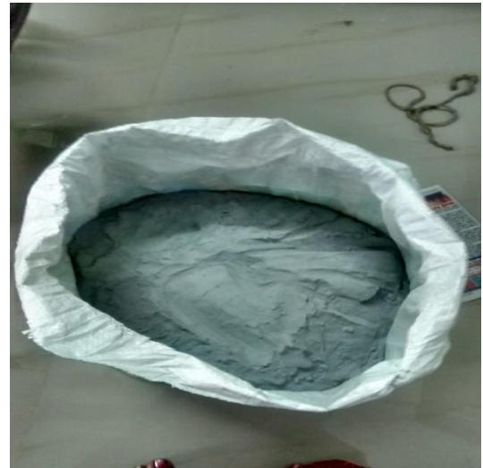
Fig.1 – Silica fume

Silica Fume is a by-product derived during the production of elemental silicon or an alloy containing silicon and it is very fine non-crystalline silica produced in electric arc furnaces. The tests done on Silica fume are given below