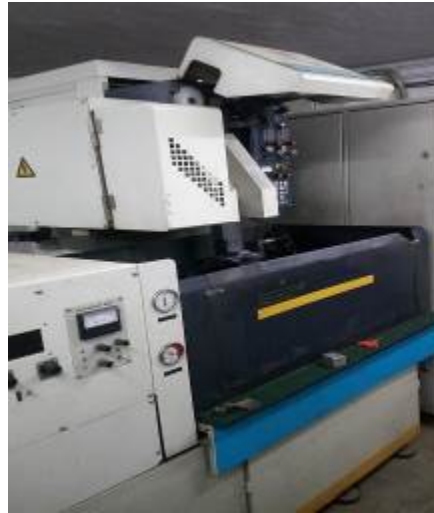
Fig. 1: WEDM machine

During this study, series of experiments on the D2 tool steel were conducted by WEDM process (shown in Fig 1) to examine the effect of input machining parameters, such as current, voltage, pulse on time, pulse off time and wire tension on cutting rate and surface roughness.